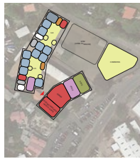
Existing Footprint: 39,682 GSF

Ulla F. Muller Elementary School currently serves grades K-6. The campus consists of three linear buildings in a u-shape on a relatively flat site.