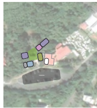
Existing Footprint: 25,718 GSF

Joseph Sibilly Elementary School currently serves grades K-6. The campus sits in a tropical setting with many changes in topography.