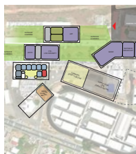
Existing Footprint: 192,908 GSF

Charlotte Amalie High School currently serves grades 9-12. At present, teachers and students are primarily using modular structures on the former playing field. The existing school structures are mostly shuttered in place.