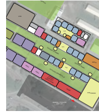
Existing Footprint: 76,476 GSF

Juanita Gardine Elementary School currently serves Grades K-8. The campus contains multiple, long, linear buildings with green space in between.