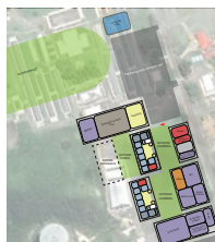
Existing Footprint: 164,803 GSF

St. Croix Central High School currently serves grades 9-12. The school is comprised of multiple linear buildings on a relatively flat site.