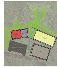
Existing Footprint: 52,128 GSF

Julius E. Sprauve Elementary School currently serves grades K-8. The campus sits in an urban setting and a significant percentage of students are currently being served in modulars.