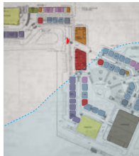
Existing Footprint: 115,870 GSF

Bertha C. Boschulte Middle School currently serves grades 6-8. The campus features a central courtyard and is surrounded by forests.