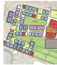
Existing Footprint: 59,530 GSF

Lockhart Elementary School currently serves grades K-3. All of the students are currently in modular structures as the Addelita Cancryn School student population resides in the Lockhart building.