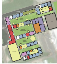
Existing Footprint: 91,326 GSF

Claude O. Markoe Elementary School currently serves grades PreK-8. The school is made up of multiple, long, linear buildings on a relatively flat site.