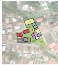
Existing Footprint: 15,488 GSF

Jane E. Tuitt Elementary School currently serves grades K-5. The campus is composed of small buildings arranged around a central courtyard.