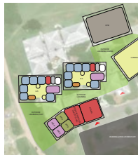
Existing Footprint: 128,836 GSF

Evelyn M. Williams Elementary School, is currently closed and shuttered with no students. The campus contains square buildings, at various stages of disrepair, surrounding a central courtyard. It is scheduled to be demolished the Summer of 2020 in order to facilitate construction of the new Arthur Richards PreK-8 facility, slated to be one of the first projects implemented.