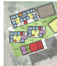
Existing Footprint: 56,450 GSF

Alfredo Andrews Elementary School currently serves grades K-6.