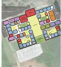
Existing Footprint: 84,359 GSF

Pearl B. Larsen Elementary School currently serves grades PreK-8. This school is one of the few completely enclosed buildings on the island.