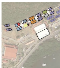
Existing Footprint: 134,313 GSF

Ivanna Eudora Kean High School currently serves grades 9-12. The school has various rectangular buildings arranged in a linear fashion at the top of a hill.